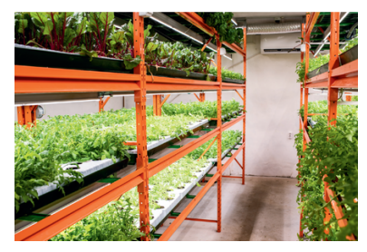
Create linear, doubled, or multiple configurations for shelf-based growing.

Effortlessly achieve canopy or side lighting in grow tent setting.